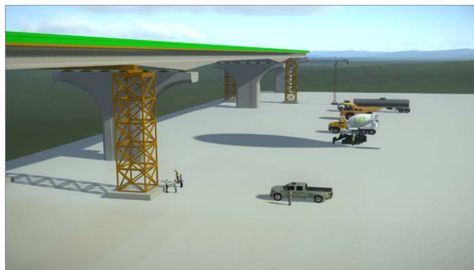
Create stunning visuals to enhance visualization and accelerate approvals.

The integrated direct exchange of bridge geometry among various stakeholders improves decision-making for design and construction, connecting and enhancing workflows. You can also perform detailing with ProStructures, visualize soil boring data with OpenGround ® , and store and query bridge inspection reports with AssetWise ® Inspections. OpenBridge Modeler works seamlessly with ProjectWise ® .